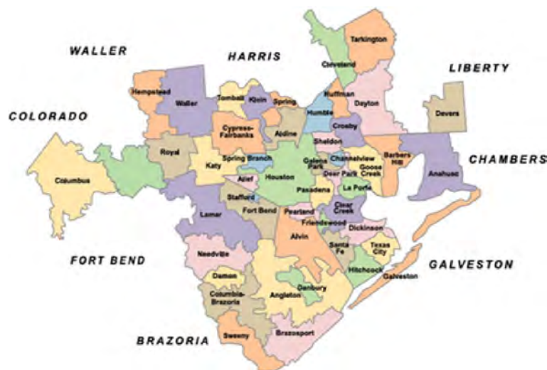
REGION 4 DISTRICT MAP